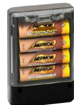
9614 Sierra Wave™ 14-Watt Power Hub