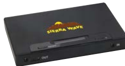
9660 Sierra Wave™ 60-Watt Power Cell