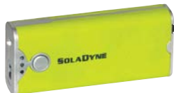
7403 SolaDyne® Ray 'N Go Battery Cell